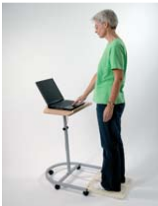
mCTSIB - Eyes open on firm surface (Cart is not sold through GN Otometrics)

Full Clinical provides custom balance assessment and gives the tester the ability to define any condition used for evaluation on the force plate and calculates the duration, path length, sway velocity, rectangle, variation (lateral), variation (a-p) and sway area for each condition. There are 6 definable conditions available. These conditions can be used for balance assessment or training. The Full Clinical version also includes all software features of the Balance Screener and the Balance Trainer.