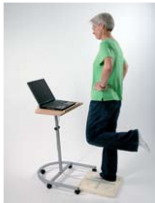
Balance Training using the One-leg test (Cart is not sold through GN Otometrics)